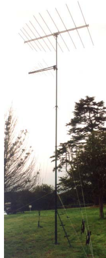
Telescopic Push-Up Mast Supporting Racal Log Periodic Antennas

Manufactured from high tensile aluminium alloy, the 798 mast comprise five sections to ensure a combination of minimum weight, minimum retracted height and maximum strength. Each section is pushed up and positively locked in its full or partially extended position by a specially designed friction clamp. This clamp is a particular feature of these masts and provides a positive self-aligning clamping force actuated by a lever forming part of an over-centre toggle arrangement. Another important feature of this series of masts is the damping effect during retraction. The rate of fall during retraction is controlled by a pneumatic damping system which ensures the safety of the operator and the mast head equipment. The piston seals are so designed that they give sufficient cushioning effect during retraction while imposing minimal drag during manual extension. All masts are precision engineered and manufactured to meet the most exacting requirement of modern communications. Although primarily for military use to support various types of antennas, the masts are used in a wide range of alternative applications, including support of CCTV cameras, public address loudspeakers, floodlights and emergency lighting for airfields and construction sites. The standard colour is anodised green with optional colours of black and sand also available. Mounting kits are available for ground, vehicles and shelters, as well as a variety of other ancillary equipment.