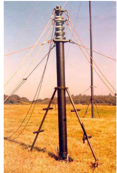
Typical Heavyweight Mast

All masts are precision engineered and manufactured to meet the most exacting requirement of modern communications. Although primarily for military use to support various types of antennas, the masts are used in a wide range of alternative applications, including support of CCTV cameras, public address loudspeakers, floodlights and emergency lighting for airfields and construction sites. The standard colour is anodised green with optional colours of black and sand also available. Mounting kits are available for ground, vehicles and shelters, as well as a variety of other ancillary equipment.